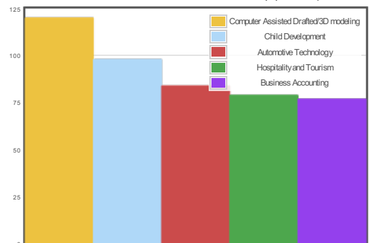
Career Technical Education Course(s) Completed

SGHS has a CTE program with courses in the areas of Computer Assisted Drafting and 3D Modeling, Child Development, Automotive Technology, Hospitality and Tourism, Business Accounting, Construction, Office Technology, Cadet Corps, Computer Technology, and Sports Medicine. Our CTE program offers courses that have been aligned with local and community college standards. Members of the SST collaboratively teach, meet with and assist our students in developing an educational and career plan that aligns with their personal goals. The successful completion of a CTE course is considered a "C" or better, which affirms their academic and career readiness in that particular CTE course. The graph shows that the successful completion of select CTE courses for the 2015-2016 school year were 120, 98, 84, 79, and 77 respectively.